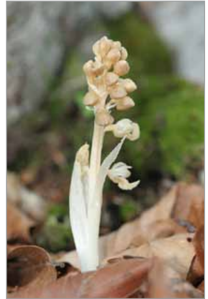
Bird's Nest Orchid Neottia nidus-avis has no leaves or chlorophyll, and parasitizes other plants for nourishment.

This is still a low level of seed set compared with most of our other orchids, but is an improvement on previous years when none or very few swelling pods were seen.