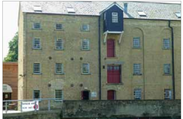
Jordans Mill.

Good weather was predicted for the BNHS Family Activity Day hosted by Jordans Mill, Broome on Sunday 18 th May and so it turned out. It might have been a little too good or maybe there was too much sport on Saturday but the numbers of visitors to Jordans Mill was rather less than anticipated for the weekend. However for everyone that turned up a good time was had by all. There was a magnificent display with many of the members' interests on show. High praise to all those that contributed including those that were unable to attend on the day.