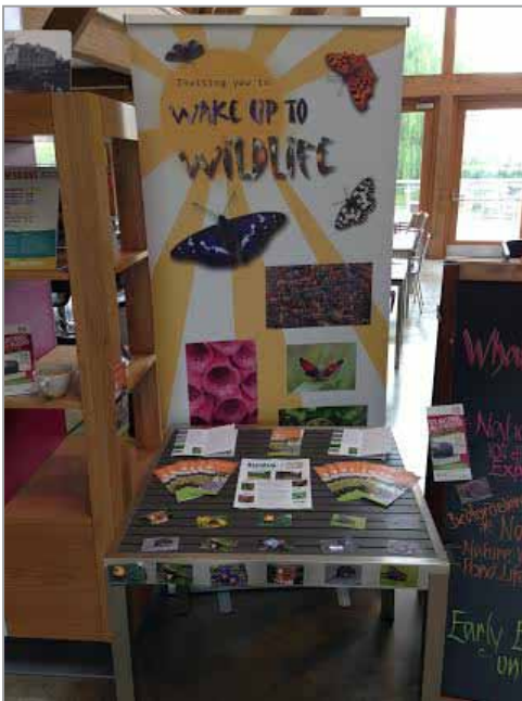
BNHS display.

CDs of Bedfordshire's wildlife and the orchids that we are seeking to record this year were set up in the education barn. Both old and new display boards were filled with a collection of local wildlife photographs. A new quiz has been devised that features common insects, flowers, orchids, butterflies and birds and was popular with children and adults alike although there were few formal entries for the prize book. A Jordans cereal bar was given to all the children that took part as they all scored very highly.