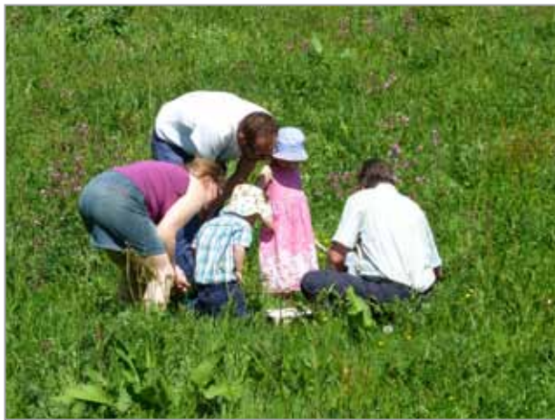
Examining a pitfall trap.

Other members came with their families and friends so thank you to them as well for supporting the occasion.