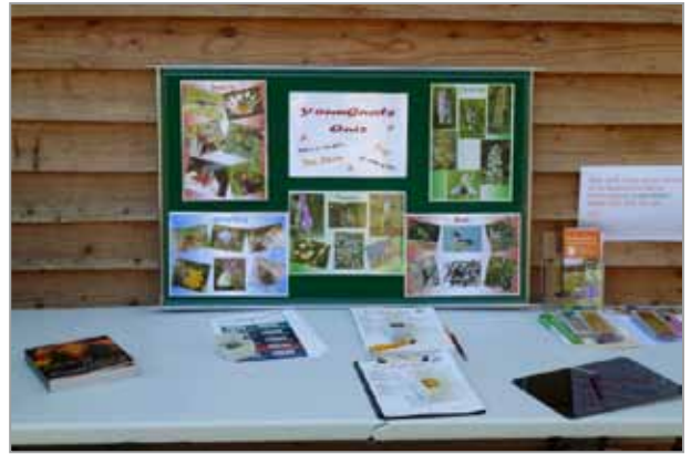
YounGnats Quiz.