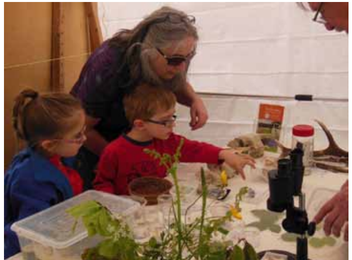
Used with permission.