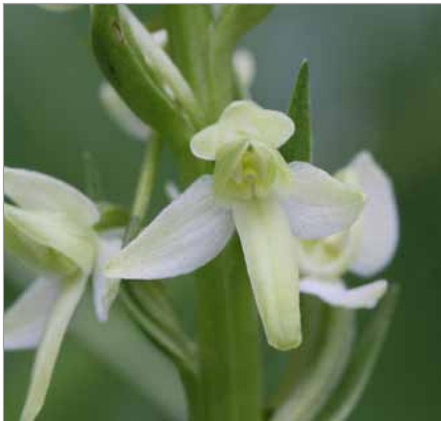
Lesser Butterfly-orchid Platanthera bifolia .

Records continue to come in on the Adnoto system found on the BNHS web site, and there is an interactive map of orchid locations that need checking this year provided by Chis Boon and Keith Balmer which I think is impressive. We have received over 1800 entries and look to easily reach 2000 soon now that we are in the peak flowering time for our commoner orchids. Common Spotted Orchids have been reported in the hundreds and in some cases thousands, and Dallow and Dunstable Downs are excellent locations to visit.