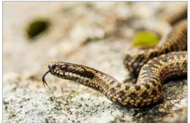
European Adder Vipera berus .

You can contact me at sue.raven@greensandtrust.org , on 01234 743666 or at The Greensand Trust, Working Woodland Centre, Maulden Wood, Bedford, MK45 3QT.