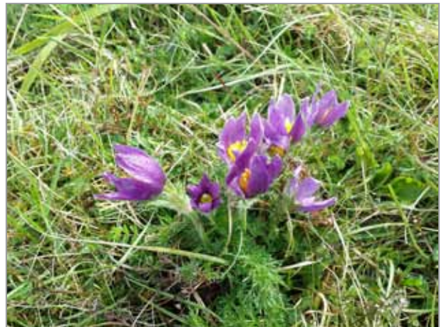
Pasqueflower Pulsatilla vulgaris at Barton Hills.