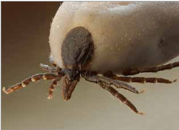
Sheep tick Ixodes ricinus full of blood. This species can occur on sheep, deer, cattle, cats, dogs and is also the one that most often bites humans.

mouth parts can be seen from above because the shield does not cover them.