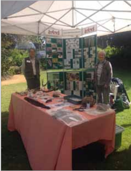
The BNHS stand at Swiss Garden.

was tailored for the BNHS and if you are interested in seeing the notes and specimens of early naturalists that comprise the county records I would recommend that you get a small group together and ask for this session to be repeated. The morning finished with lunch in the museum café.