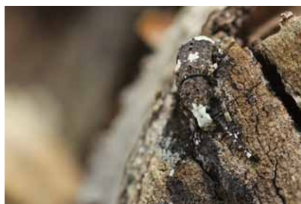
Platystomos albinus .

This is the rarer of the two species and is nationally scarce, being classified as 'Nationally Scarce Nb', meaning that it has only been recorded in 30 to 100 ten kilometre squares of the national grid. In Bedfordshire, the only recent records are from the grounds of The Lodge (RSPB Sandy). The adult weevil is brown or grey with white patches on the head and at the hind end of the wing cases (elytra). There are also white markings on the legs and on the antennae and a distinct white mark in the middle of each wing case. This weevil shows sexual dimorphism; the male has much longer antennae than the female. If the antennae are laid back along the body they would reach the middle of the wing cases in the male but only the base of the thorax in the female. Platystomos