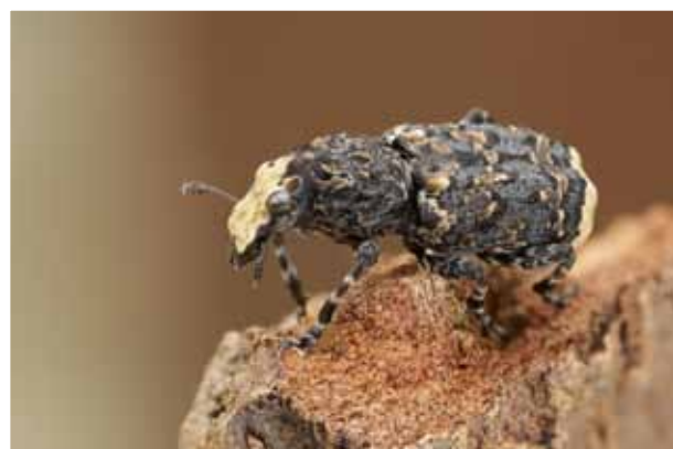
The Scarce Fungus Weevil Platyrhinus resinosus .

This weevil has been recorded more widely in Bedfordshire than has P. albinus , with recent records from Barton Hills Nature Reserve, Dropshort Marsh Nature Reserve (Toddington), Drover's Spinney (Shefford), Kempston, Ketsoe Row, Lousey Bush Nature Reserve (Eyeworth), Maulden Wood, Northill, Priory Country Park, The Lodge (SRSPB Sandy), Upper Caldecote and Wrest Park. The adult is dark brown to greyish black patterned with small brownish patches and with large ochreous patches on the head and hind end of the wing cases. The larvae develop in fruiting bodies of the fungus Daldinia concentrica , commonly known as Cramp Balls or King Alfred's Cakes. These are round and black, occurring on dead wood and almost exclusively on dead and dying Ash trees. With the recent appearance of Ash Dieback disease, caused by the fungus Hymenoscyphus fraxineus (= Chalara fraxinea ), dead and dying ash trees are becoming increasingly common in our countryside. Therefore, it will be interesting to see if there is a consequent increase in the abundance of P. resinosus weevils. Ash Dieback was first reported in Britain in 2012 and first detected in Bedfordshire in November 2013. The number of records of P. resinosus that have been received by the county weevil recorder since he was appointed in 2010 are: 2010 (0), 2011 (2), 2012