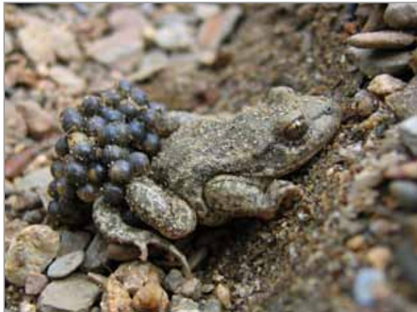
Male midwife toad Alytes obstetricans carrying eggs.

This poses some questions. Did the Cambridge colony come from Bedford or was it the result of another introduction from animals bought through the pet trade? How many of the other colonies around the country originated in Bedford? If not, where did these others come from and are they all the same species?