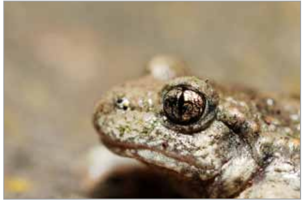
Midwife toad Alytes obstetricans.

Recently a PhD student from Imperial College did a DNA test on some midwife toads from a colony in Cambridge and these turned out to be of Spanish origin.