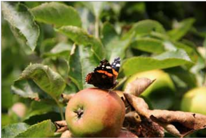
Red admiral Vanessa atalanta in a north Bedfordshire orchard.

from Wildlife Trust for Bedfordshire, Cambridgeshire and Northamptonshire